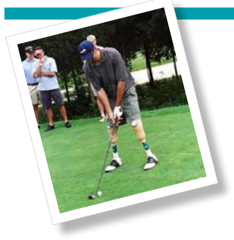
Read about Marc's story in recent Cleveland area news by going to http://www.bonfireimpact. com/2013/05/09/creating-a-ripplefor-the-betterment-of-others/

To show your support of Betterment and to help us reach our goal of sharing $1M, please use the enclosed envelope or log on to our website and click the "Donate" tab in the top right corner!